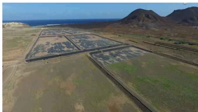
Shrimp Farm in Calhau (Inauguration in 2017)