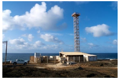
CVAO - Atmospheric Site at Calhau