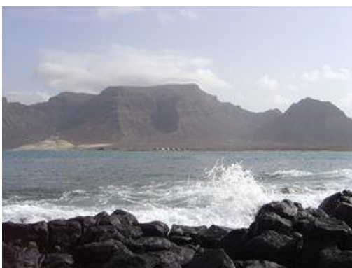
Monte Verde Mountain, 750 m high, with a view to neighboring islands