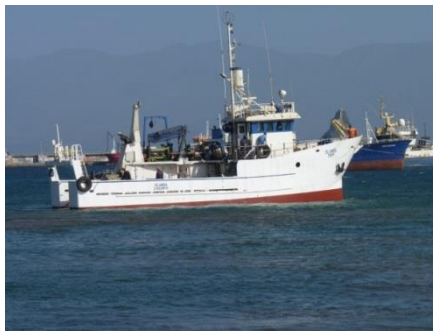
Porto Grande Harbor and RV Islândia