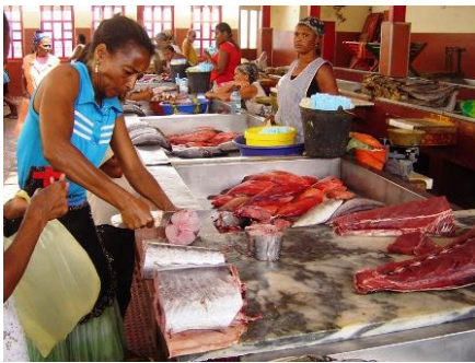
Fish market in Mindelo